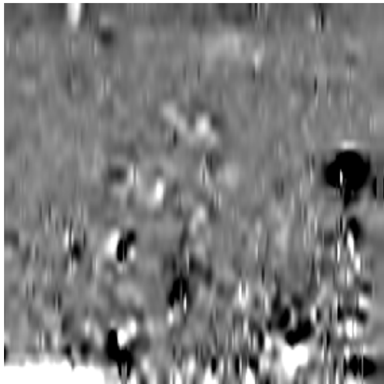
a) Linear greyscale of despiked Caesium magnetometer data.